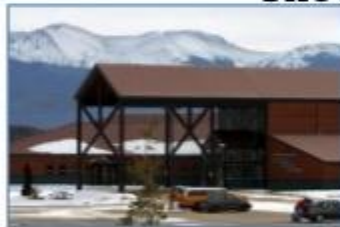
Snow Mountain Ranch Lodge Rooms