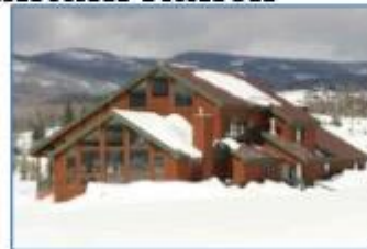
Snow Mountain Ranch Cabins